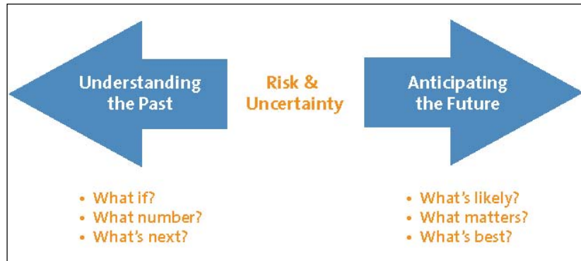
Figure 1: Understanding the past can help model the future.

To answer these questions and plan for the right decisions, you must first ascertain the potential upside and downside of future results and the probability of each outcome actually occurring.